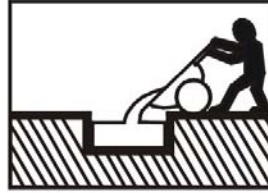
Make concrete base