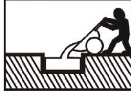
Make concrete base