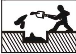
Dig the hole in the ground