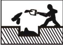
Dig the hole in the ground