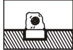
Install the garden speaker with screw